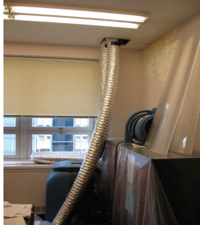
Ducting used from DH's

A roof leak at a local office building greeted workers when they arrived on a recent Monday morning. Although they acted quickly and sopped up most of