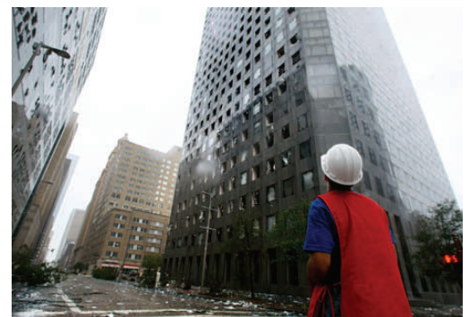
Building Damage in Houston

The G S Jones consulting team traveled to 4 states to provide damage repair estimates for insurance carriers this fall. Hurricanes Ike and Gustav left a trail of destruction from Galveston, TX to Canada.