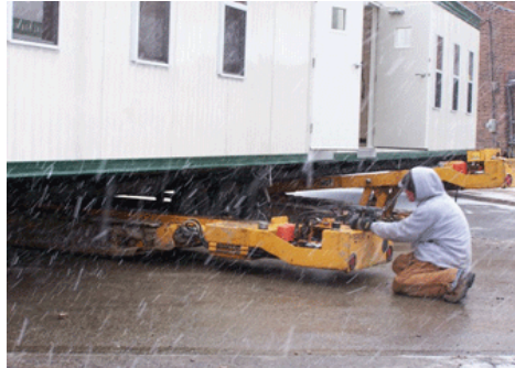
Workers position equipment to move modular classrooms