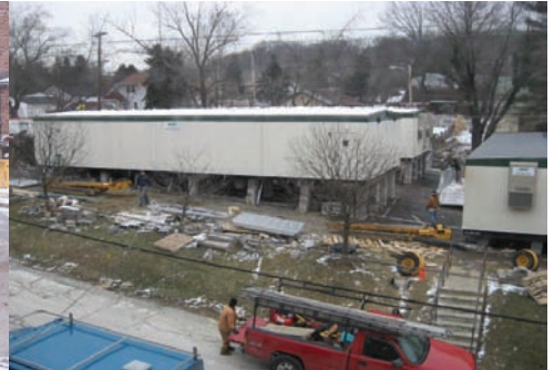
3 of 5 modular classrooms are set in place