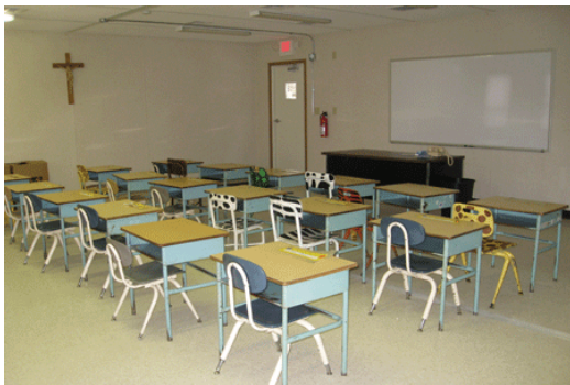
Finished Modular Classroom

There were many bumps in the road along the way. Whenever one would surface, an alternative solution would be developed and put into action. The key to the success was clear communications and willingness of EVERYONE to pull together to do what was best for the kids, and to "make it happen".